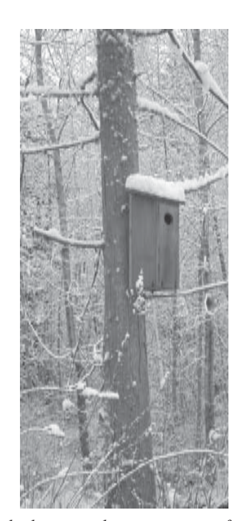
A duck nesting box is just one of the many items you'll be able to bid on at the Skagit Land Trust Annual Meeting & Auction.

Please call the Trust at (360) 428-7878 for more details on the Volunteer Events and to let us know if you are coming.