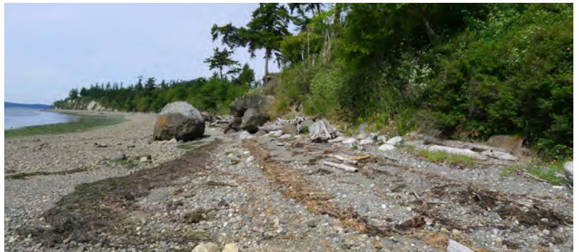
The Guemes Island Anderson Conservation Easement has great diversity including wetlands and marine shoreline.