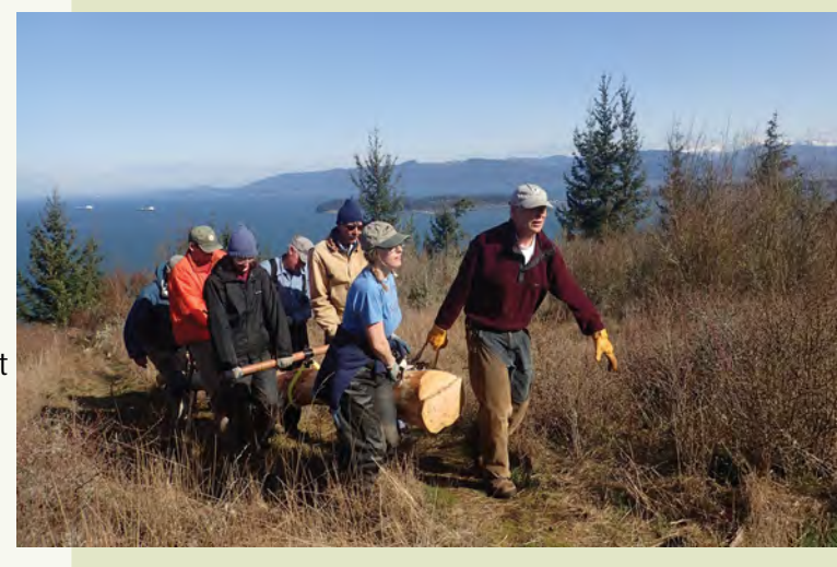
PHOTO: WORKING TO PROTECT THE SENSITIVE WILDFLOWERS ON GUEMES MOUNTAIN MEANT SOME HEAVY LIFTING OF "PERFECT" LOGS TO CREATE A PROTECTIVE BUFFER... AND A PLACE TO SIT TO TAKE IN THE VIEW.

Visit skagitlandtrust.org to view events calendar