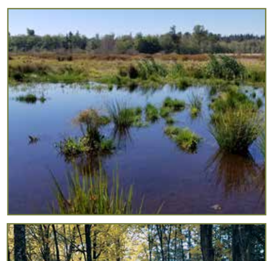
Continued from page 1...

This donation not only preserves the heart of Guemes Island but helps protect a local watershed on an island that has a sole source aquifer. This current gift of land will protect 39 acres of mature, conifer-dominated forest, about 21 acres of active agricultural land, as well as 17 acres of wetlands, open space and an iconic Guemes Valley barn.