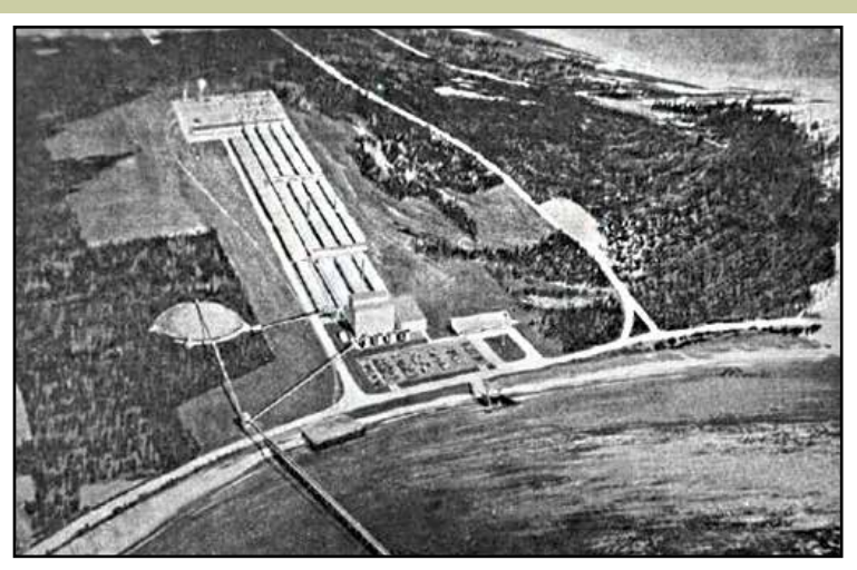
Artist's rendition of the proposed smelter on Guemes, that appeared in the Anacortes American on September 22, 1966

Since then, Guemes Islanders and visitors have continued to work to preserve elements of the Island that are so important to the community, to visitors and to wildlife. Skagit Land Trust (the Trust) is honored to be part of that work.