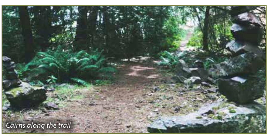
John Tursi Trail - A Scenic Connector: Connecting Deception Pass State Park and the Anacortes Community Forest Lands, the Tursi Trail offers travelers views of meadows, lakes and several rocky balds. Along the way, hikers will pass an old miner's shack, red rock quarry, and Rodgers Bluff, once home to Northwest artist Morris Graves. This trail is accessible from Pass Lake parking lot in Deception Pass State Park, or from the parking lot on the corner of Donnell and Campbell Lake Rd.