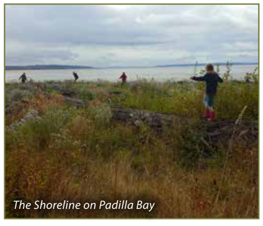
Samish Island - A Birder's Paradise: The Samish Island Conservation Area protects 84 acres at the entrance to Samish Island. From Edison, take Bayview Edison Rd to Samish Island Rd and continue .2 miles past the island welcome sign. Park on the right (north) side of the road, on a grassy area that has room for 2 vehicles. Make sure you see a Trust sign to verify you're in the right spot. Thank you for not blocking the driveway. While

walking the forest trail, notice the large mature trees, some of which are over 130 years old. Cross over the road and explore 1,600 feet of shoreline along the second largest eel grass meadow in the western United States. Expert birder? Just a hatchling? With over 220 species of birds seen on Samish Island, this property is chirping with opportunities to practice your birding skills.