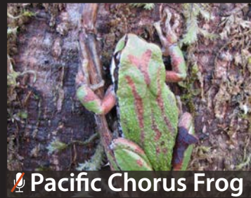
Pacific Chorus Frog