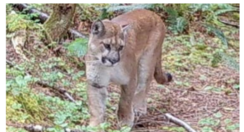
Cougar captured by Owen's wildlife camera.

“Beaver, bear, bobcat, I’ve seen them all,” says Jim. “I liked the idea of the conservation easement keeping the area a forest more than a bunch of houses. That’s what it comes down to. There seems to be more development all of the time. My property is not enough space for a bear or a cougar, but being adjacent to DNR lands is why I see these animals come through the property.”