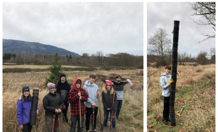
State Street students planting trees at Utopia Conservation Area.