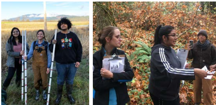
Emerson Academy students on forest monitoring fieldtrip.

Water quality issues have long been an issue for the Nookachamps. The stream suffers from high temperatures and bacteria levels. The goal of the willow stakes is to create shade for the stream, reduce temperatures, and filter out pollutants. Trust staff also maintained recent plantings along Trumpeter Creek, which flows into the Nookachamps. These plants were installed on the recently re-meandered creek near College Way in partnership with the Conservation Reserve Enhancement Program (CREP)