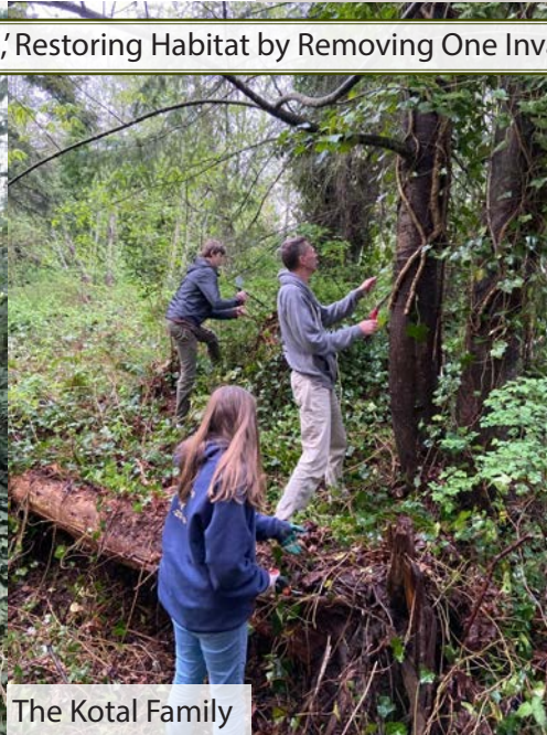
The Kotal Family