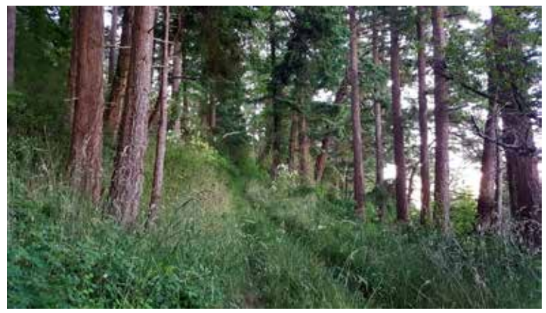
Mature coastal forest along the Padilla Bay beach side of the Samish Flower Farm property.

As real estate values have soared in the Skagit and San Juan Islands, and countless signature properties have been lost to development, Samish Flower Farm has remained miraculously whole and unaffected by these pressures. The property