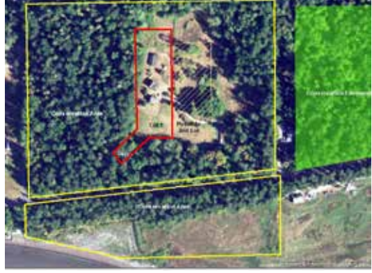
map of the property with proposed subdivision

The entire Samish Flower Farm property encompasses almost 38 acres. The conservation solution the Trust has agreed to with the landowners is that they will keep a 3- acre "homestead" containing all the current structures (lot 1 in red outline). In order to raise enough funds for this project, Skagit Land Trust may also retain a 2.5-acre parcel on the cleared land adjacent to the home site for future sale (lot 2). Skagit Land Trust will maintain ownership and manage, at a minimum, the remaining 32 acres as a conservation area encompassing all the upland forest and marine shoreline. Because we are using some state and federal grants to help purchase the land, deed restrictions will be placed on the 32 acres to ensure they are never developed.