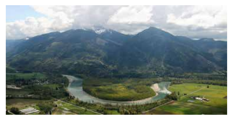
Photograph from John Scurlock shows the Skagit River hugging the bend of the Cumberland Creek Conservation Area.

This winter the Trust partnered with an EarthCorps crew to continue restoration work at our Cumberland Creek Conservation Area. Located in Seattle, the EarthCorps program focuses on developing leadership skills and ecological restoration knowledge in young adults from the United States and abroad. EarthCorps started working with Skagit Land Trust on restoration projects at Cumberland Creek in 2015. Since then they have helped remove acres of non-native invasive species throughout the property, including blackberry, butterfly bush, scotch broom, knotweed, clematis, and reed canary grass.