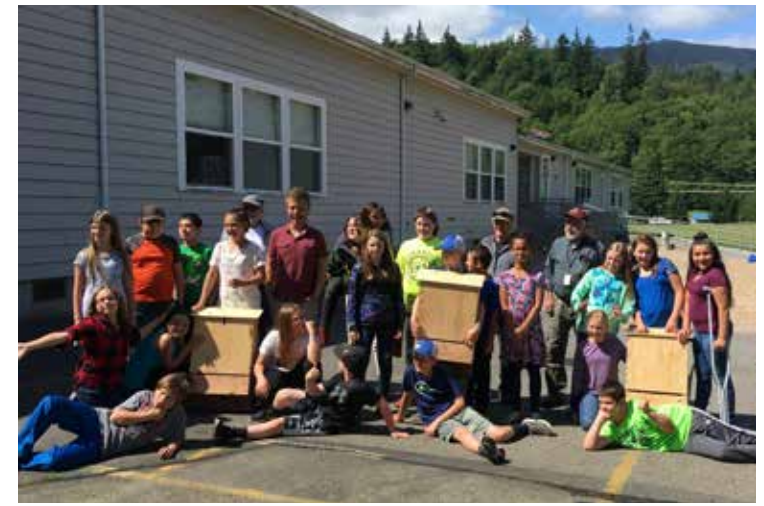
Lyman students display the bat boxes they built as part of their Conservation Classroom Experience.

houses would be painted black to absorb the sun's rays.