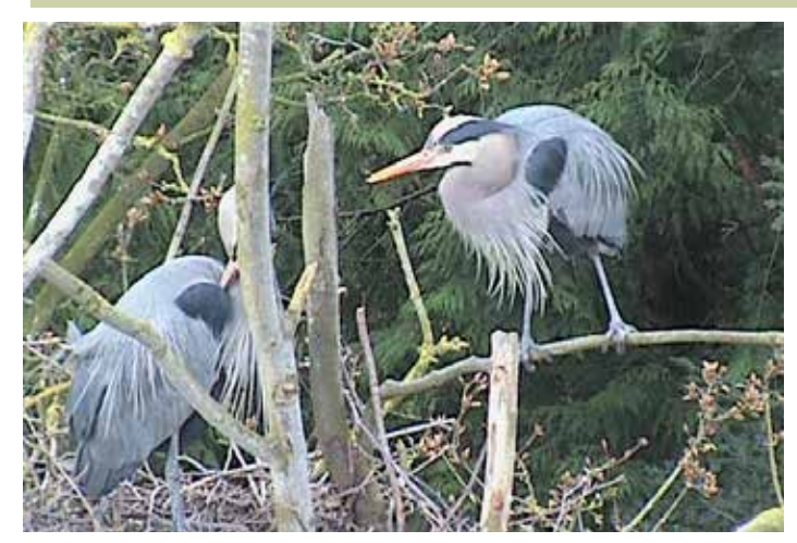
A pair of nesting herons at the March Point Heronry, which is the largest known heronry in the region.

The Trust's March Point Heronry Conservation Area grew by almost four acres in December with the purchase of a forested property adjacent to Highway 20. This diverse and maturing forest protects additional nesting spots in the heronry, which has been in use by Great Blue Herons since the mid-1950s.