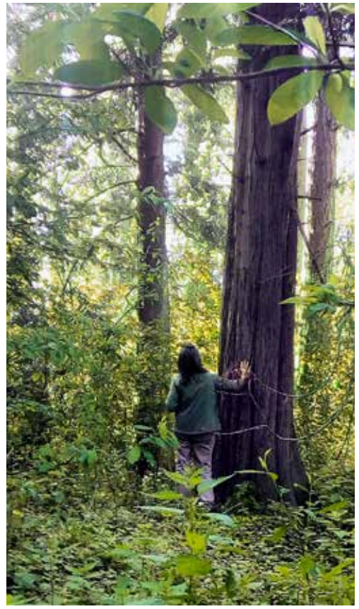
Become a Skagit Sustainer and help us know we have the funds to save places like this old growth forest.

It doesn't cost a lot to be a Skagit Sustainer- you can commit to any amount you want. Spread out over time, such a donation is easier on your budget.