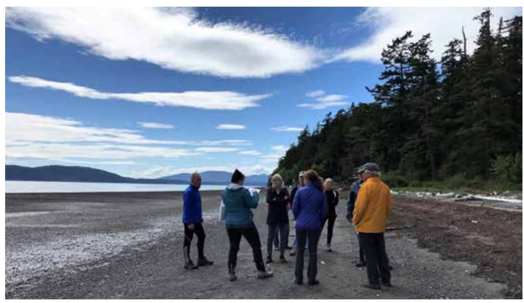
Island residents getting a tour of the beach portion of the Samish Flower Farm. The unarmored beach is a critical foraging area for Great Blue Herons and other migrating birds.

The dense forest that causes this transformation is part of the historic Samish Flower Farm, the original site of tulip farming in Skagit Valley. This property contains some of the Island's oldest