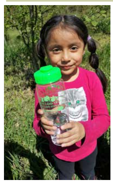
A Bayview Elementary kindergarten student gets a drink from her "Young Land Stewards" water bottle while exploring the Green Road Marsh Conservation Area.

The Trust's Engaging Youth In Conservation program saw a large increase in participants this past school year. We had over 1,000 children and young adults at Trust events on the land, doubling our number of participants from last year. From tree plantings at the Cumberland Creek Conservation Area with visiting EarthCorp crews, to teaching about invasive species on the Skagit Youth Conservation Tour at Pomona Grange, Trust staff were able to introduce the next generation of Skagit land stewards to natural places and conservation practices needed to care for the land.