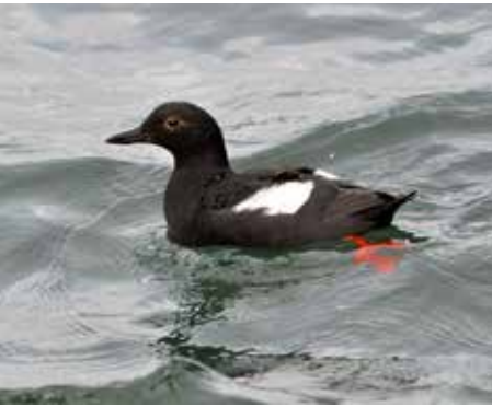
Pigeon Guillemots nest on Yellow Bluff.

island properties. The beaches built and maintained by these bluff sediments act as a natural barrier to wave induced erosion. According to Board Member and WWU Ecology Professor Roger Fuller, "As sea level rise increases the delivery of sediment from the Kelly's Point, that added sediment will drift to the east and help the beaches and freshwater wetlands adapt to sea level rise for a few decades".