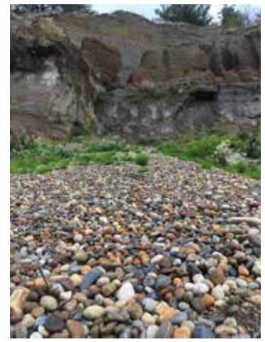
The naturally eroding bluffs of Kelly's Point feed local beaches.

The mature coastal forest maintains a natural rate of erosion and slows surface runoff. In contrast, major bank failures are more likely on cleared bluffs, and erosion rates accelerate substantially. As sea level rises and storm events intensify, allowing Yellow Bluff to erode naturally will help to mitigate the impact of climate change on nearby wildlife habitat and