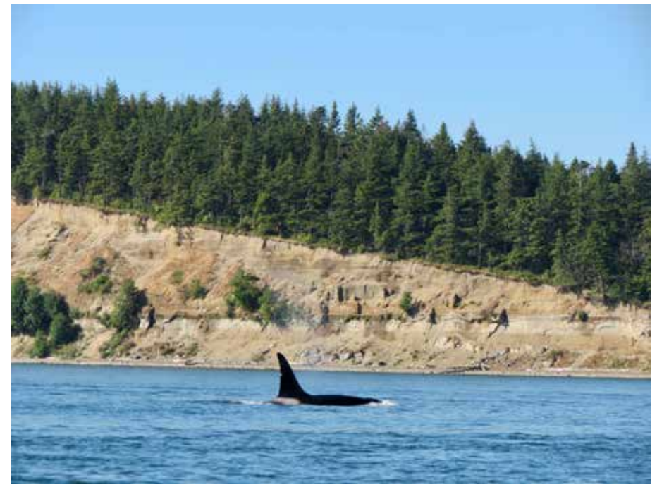
Steering committee member David Wertheimer snapped this picture in June of an Orca whale swiming past Yellow Bluff.

Located on the Southwest corner of Guemes Island, this well-known landmark with its immense layered bluffs can seen from boats entering and leaving Anacortes. It is one of few places remaining in the region with mature coastal forest along more than 3,000 feet of undeveloped shoreline. The Trust successfully purchased the $1.38 million property in February 2018, permanently protecting it from development and allowing the beach to remain open to the public.