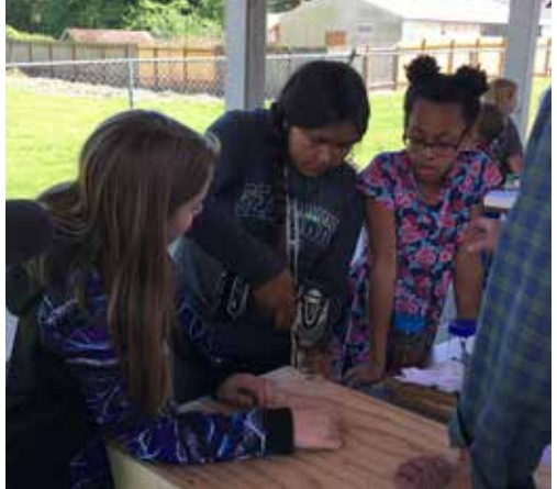
Students screwing together their bat box under the watchful eye of a Trust volunteer.

With the help of the Trust volunteers, students assembled bat boxes this May. For many students it was their first time operating power tools! The students were proud of their creations and signed their work, despite knowing that the