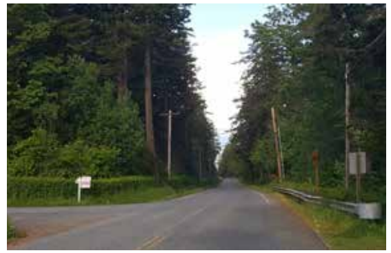
The current forested view from the corner of Samish Island Road and Roney Road