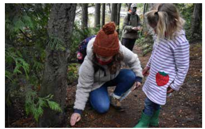
Left to Right: Community members hiking in the ACFL in the early 1980's; A family participating in a scavenger hunt event this fall in the ACFL hosted by Skaqit Land Trust and Friends of the Forest.