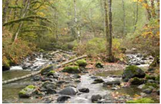
Cumberland Creek Conservation Area

"Deciding on Skagit Land Trust as a beneficiary was a no-brainer for me since the Trust's work so strongly aligns with my own priorities. Designating Skagit Land Trust as a beneficiary from my IRA was easy...just one signature!"