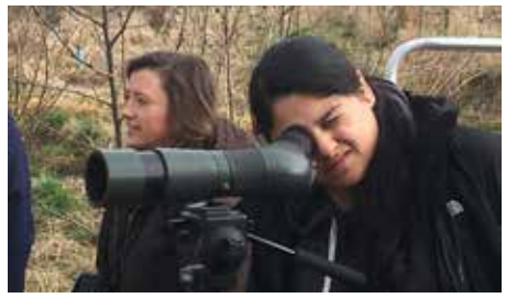
Walks will include opportunities to learn about and view birds found on the property

We invite you to join us for a tour of Barney Lake where we will look for beaver, great blue heron and other wildlife that share this land with us. During the walk, Trust staff will share the history of this property and how we hope to expand public access in the future. Most importantly, we'd like to hear your thoughts on how you would like to connect the community with these natural lands while protecting its wildlife. Please join us at one of our "Heron & Beaver & Frogs, Oh My!" walks in the month of May. See the Trust Events page for details.