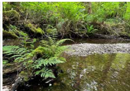
A path through the protected forest on the property; views of Mount Baker; Gribble Creek.