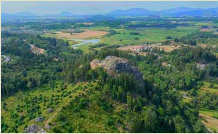
Looking north from Big Rock towards the Barney Lake wetlands, Skagit River, and the Salish Sea in the distance

and connecting native habitat as Mount Vernon grows around it.