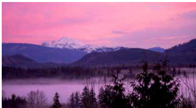
Views of Mount Baker above the regenerating forest.