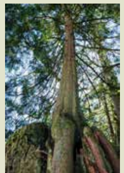
Wildlife & native plants found throughout the property