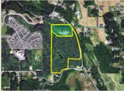
Big Rock County Park in 2001 and hopeful expansion in 2023

In early 2023, the property was about to be sold and carved up for exclusive lots. Skagit Land Trust deemed this land such a critical part of our community's future that we agreed to purchase the property to get it off the market and try to protect it. The Washington Opportunity Fund assisted with a generous loan and we borrowed from our internal reserves. However, this is a temporary solution. Skagit Land Trust must pay back its loans. The land is not yet protected forever. If we cannot raise these funds, we will have to sell part, or even most of, the 63-acre addition to pay back loans.