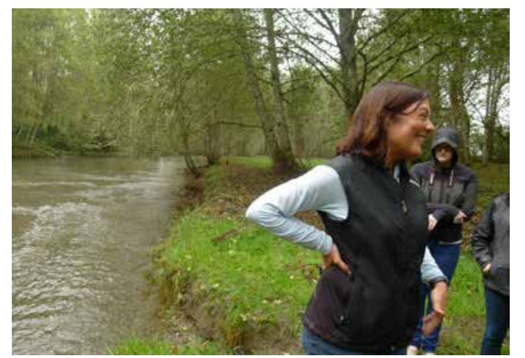
Congresswoman Susan DelBene visits the Trust's Illabot Creek Conservation Area which holds vital Chinook salmon spawning and rearing habitat.