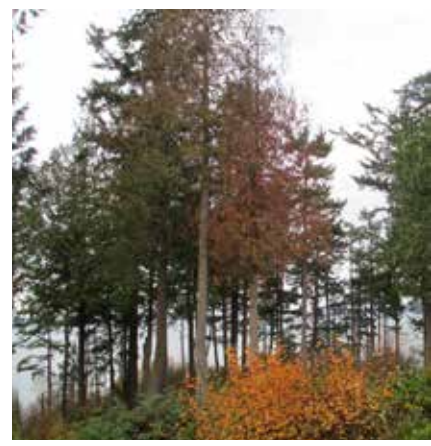
Drought stressed Western Red Cedars.

<u>A New Conservation Priority</u> – Since we can't stop climate change, we need to prepare for it. For the Trust, that means rethinking how and where we do land conservation. Planning enables us to focus on places that store carbon and will help wildlife and people survive in our changing climate. Our work includes both mitigation and preparation. Mitigation actions prevent or sequester emissions of carbon dioxide and other greenhouse gases. Forests, soils and wetlands play a major role in storing carbon, so the Trust can help