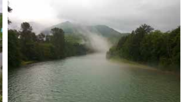
40 miles of shoreline now permanently protected.