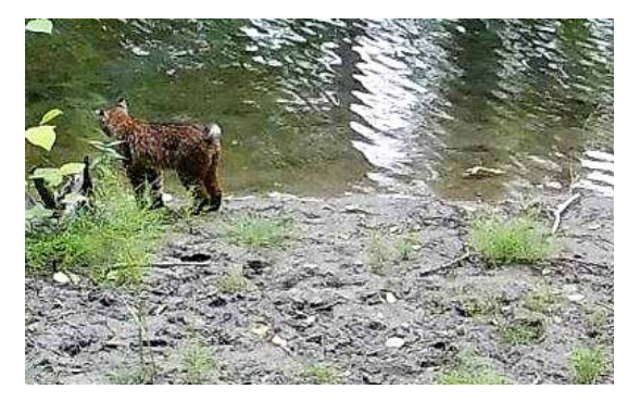
Immeasurable cool creatures found on Trust lands