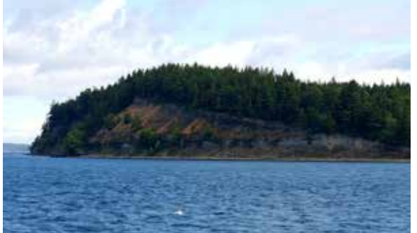
8 land protection projects completed, including Kelly's Point (above)

This past year our team grew stronger and our supporters hit it out of the ball park to help save and steward local lands.