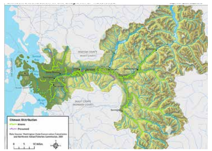
Skagit watershed Chinook distribution map created by Skagit River System Cooperative

The future of the Orcas may be uncertain; but we know for a fact that our collective efforts are an essential part of the solution. Helping to save land that enables natural processes that stabilize and recover Chinook salmon is one of the best ways we can help the Orcas. Let's keep at it!