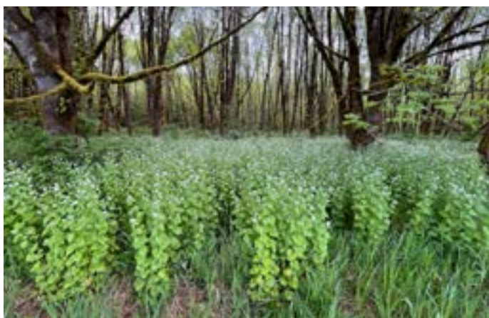
Garlic mustard, growing tall before being removed by volunteers.

In most situations, control of unwanted invasive species can be done using mechanical methods such as pulling, digging, cutting, and shading. With garlic mustard, early action is everything. Due to the large size of the