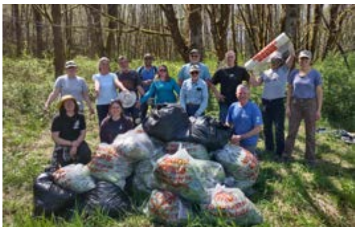
Work party poses proudly with bags of garlic mustard to pack out.

infestation at Pressentin Ranch, contractors were hired in early spring to help combat garlic mustard during its hard-to-pull rosette stage (before it "bolts" or flowers). Our Stewardship team returned later with volunteers to manually pull and pack out any remaining plants before they went to seed. We also carefully brushed our boots before leaving the site, and we will continue to monitor trails where seeds might have hitched a ride on boots or paws. Staff and volunteer fingers may reek of garlic for hours afterward, but it's the smell of hard-earned progress!