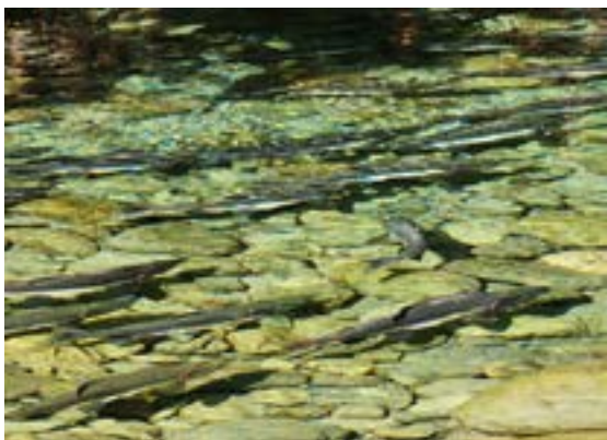
Above: Each fall, Diobsud Creek teems with native salmon making their way home.