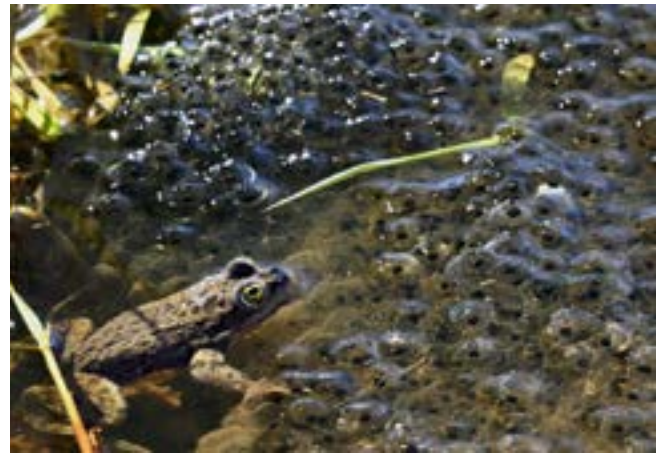
Oregon spotted frog with egg masses.