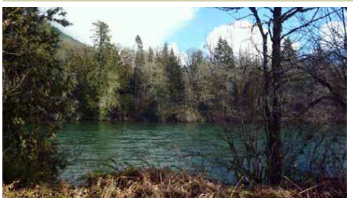
Upper Skagit Burke – This acquisition near Marblemount preserves 20 acres of forested floodplain. The purchase, together with an adjacent conservation easement held by Skagit Land Trust, protects 1350 feet of high quality salmon habitat along the shores of the wild and scenic Skagit River.