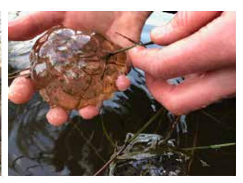
Volunteer citizen scientists at Big Lake Wetlands counting Northern Red-Legged Frog egg masses

Amphibians are an excellent indicator of environmental health. Due to their moist, permeable skins they are vulnerable to changes in water availability and quality. Many species migrate between the water (for breeding) and the land (for foraging and over-wintering), making them susceptible to habitat changes and micro-climate variations. Amphibian populations benefit other wildlife, as they are a food source for many predators and reduce excessive richness of nutrients by consuming zooplankton and algae. Many scientific reports have documented declines in amphibian populations, highlighting the need for data collection to determine potential causes and develop ways to improve amphibian habitat. During the 2017 amphibian monitoring season, 23 citizen science volunteers and land stewards contributed over 155 hours in the search for amphibians and their egg masses. Nine Trust properties were surveyed with the following results. Thank you to all of the citizen scientists that participated!