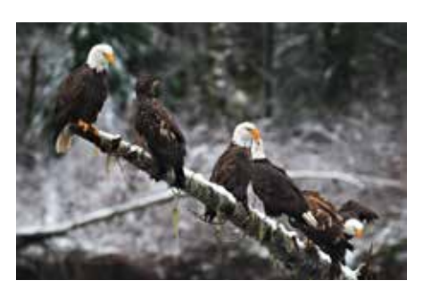
Bald Eagles

A desire to protect bald eagle habitat is what first motivated TNC and other community partners to conserve many of