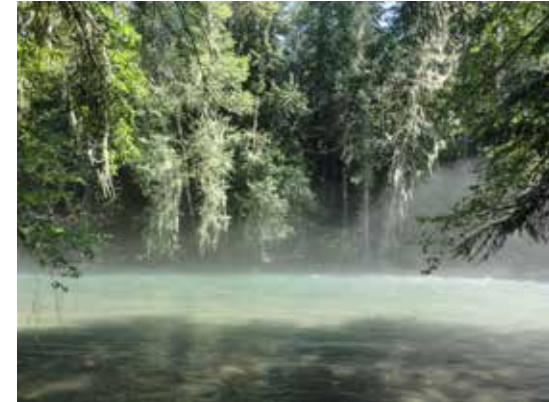
Lichen hanging from the trees at Cascade River South

plants such as wildflowers and berries, which in turn provide food for wildlife in the area. This new property is adjacent to two other Trust conservation areas, ensuring the protection of a large portion of Cascade River shoreline.