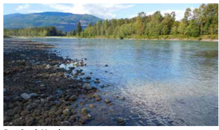
Day Creek Meadows – Skagit Land Trust has acquired 40 acres along the Skagit River, adjacent to 21 acres already owned by the Trust. Two sloughs flow through these lands, reflecting how the dynamic Skagit River has shifted throughout the years, creating wonderful habitat. A wildlife camera set up by the Trust here has captured pictures of elk, deer and bobcat visiting the property.