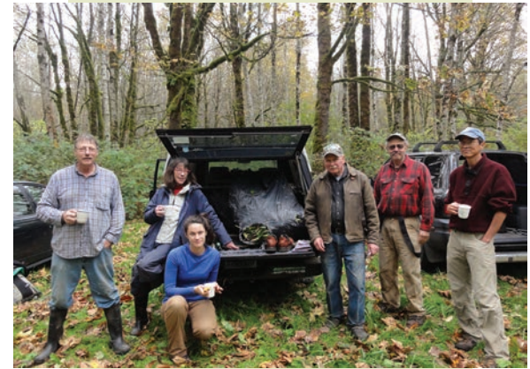
above: These hardy volunteers spent the day "sawing" ivy at Cumberland Creek.

A third conservation acquisition expanded the Trust's 87-acre Hurn Field Conservation Area when 5.5 acres were added in September, again with funding from SRFB and assistance from Seattle City Light. This popular wildlife viewing pullout on Highway 20 west of Concrete allows people to appreciate Hurn Field's important fish and wildlife habitat. The Trust is excited to further Skagit River shoreline protection and will continue to work with partners and volunteers to restore the natural values of these properties for the benefit of wildlife and people for many generations to come.